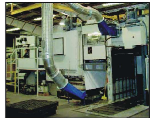
✦ Die Cutter With Pick-ups

Box plants, sheet converters, food and pharmaceutical packaging, OCC, POP displays... the folding carton industry covers a wide variety of products, but the scrap management issues have much in common. Dusty environments, poor grade segregation, light bales, overburdened air conveyance systems; all contribute to reduced scrap revenues, decreased production, and increased labor costs for you. AES has helped many folding carton operations overcome these problems with efficient scrap removal systems. We understand your industry, and we have the experience to resolve your scrap issues effectively and efficiently.