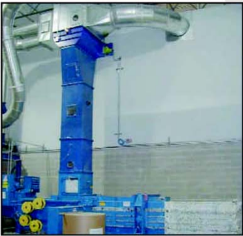
↙ Auto-Tie Baler

The efficiency of your operation depends on a trim removal system that can keep up with your advanced presses. We can design and install an efficient, economical system that will quickly transform your trimming problems into trimming solutions. Working with AES can mean efficient trim conveyance, effective dust control and fire suppression, functional grade segregation, and improved plant cleanliness. Our high-speed solutions manage trimmings just as quickly as your presses turn out finished product.