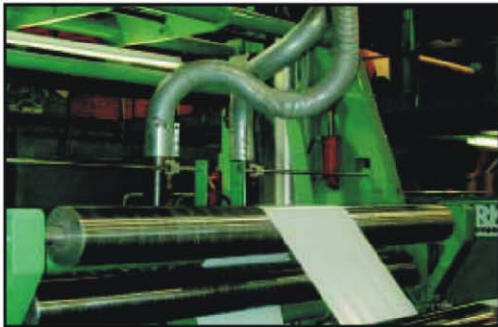
↪ Slitter/Rewinder with Side Trim Removal

At AES, we understand the importance of keeping your operations running at peak efficiency. We know your equipment and how to effectively handle the broad range of scrap that is generated. Our scrap handling systems incorporate the latest technology and will return real value to your bottom line – for today, and well into the future. Talk to us about making this a reality at your facility.