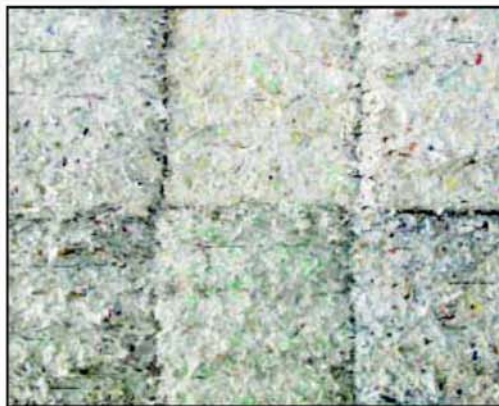
Cascade West Photography.

Listening is the key to building and maintaining relationships. We take great pride in our ability to listen to the needs of our customers, and to design reliable systems that meet those needs.