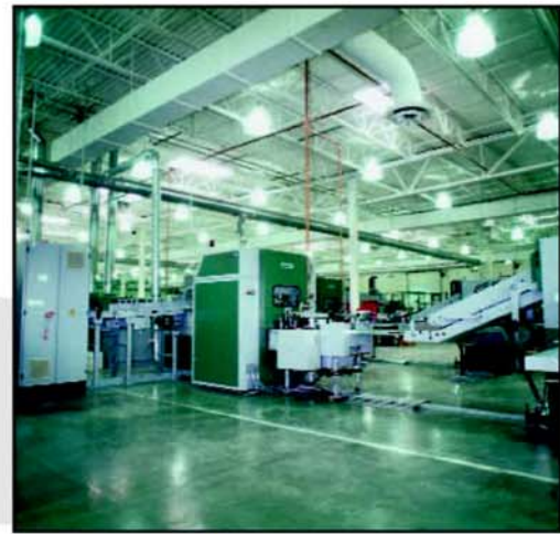
↙ Finishing Department with Ducting and Drops

Folding, cutting, trimming, glue binding and stitching operations all generate vast amounts of scrap of every size and grade. In today's competitive marketplace, an organized, efficient, and clean workplace can be the edge you need to stay on top of your game. At AES, we understand your manufacturing process, and that a well-designed scrap handling system can boost your productivity and profitability. In many cases, our customers enjoy a very meaningful return-on-investment with their scrap baling system through increased scrap paper revenues.